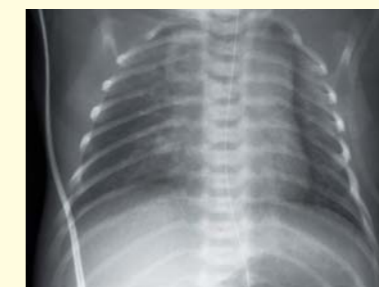
ST-BD (30% dose reduced)

For pediatric imaging, when comparing ST-BD and ST-VI images of chronic lung disease, the images of ST-BD provided clear contrast of the peripheral vessels and bronchi with 30% less radiation than ST-VI.