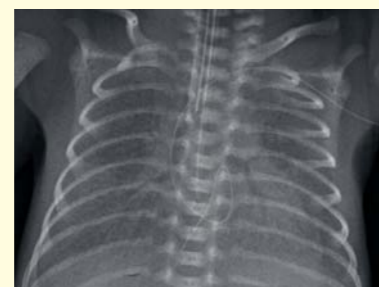
ST-BD (Processing for Catheter)